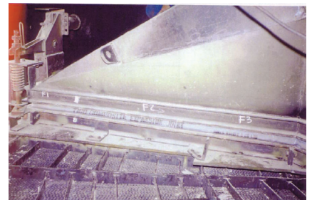
Air heater seals