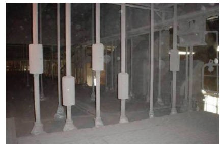
Sling rod seals

In addition, the company provides an expansion joint thermographic survey service together with 24/7 emergency breakdown cover. (24/7 cover is available only in the UK)